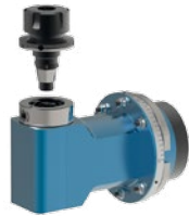
Angle head, adapter incl.