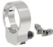
Torque arm, stop block incl.